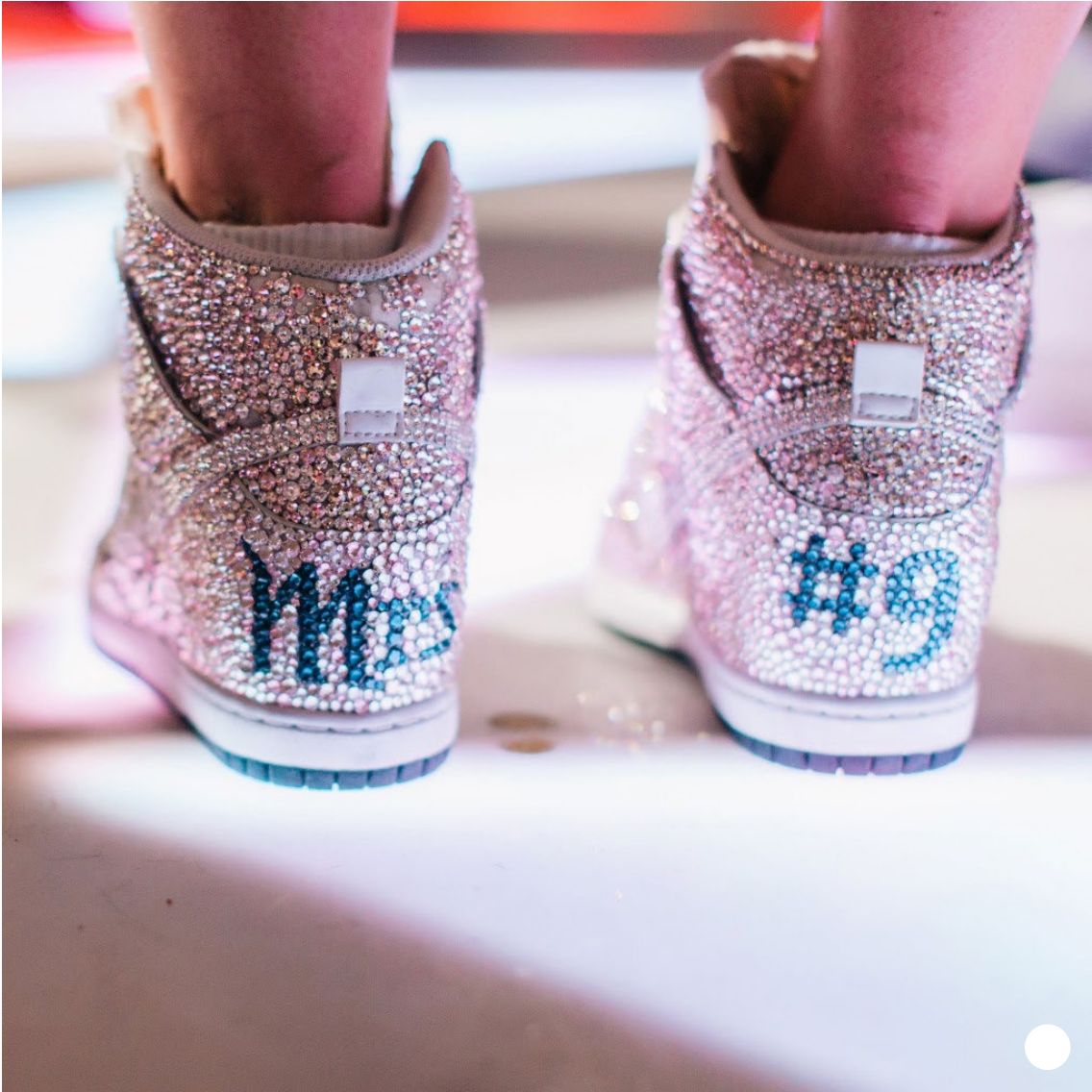
We also brought in a slow-mo video booth which had a line the entire night long.